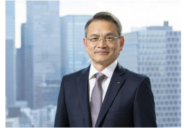
Member of the Board, President & CEO

As we aim to achieve further growth as a company, in April 2022, Daiichi Jitsugyo established “ Connecting People, Connecting Technology and Enriching the World ” as its new corporate philosophy, and on April 1, 2024, revised the Daiichi Jitsugyo Code of Conduct as the DJK Group Code of Conduct in order to respond to the demands of society arising from the changing times through integrated Group efforts.